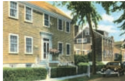
First Home of NCH