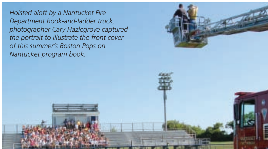
Hoisted aloft by a Nantucket Fire Department hook-and-ladder truck, photographer Cary Hazlegrove captured the portrait to illustrate the front cover of this summer's Boston Pops on Nantucket program book.